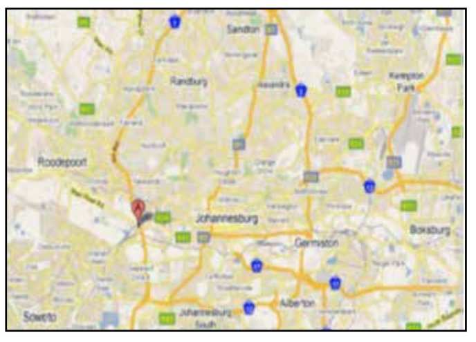
Figure 4: Location of Pennyville in Relation to the Jhb CBD

The Pennyville development has its origins in 2006. Its purpose was to provide accommodation for the Zamimpilo Informal Settlement. A land-swap agreement was reached between the City of Johannesburg and Safrich with the understanding that a development vehicle consisting of Safrich and Calgro M3 would undertake the development of the Pennyville site for the city in line with the City's specific needs (Erasmus, 2015; CoJ, 2007).