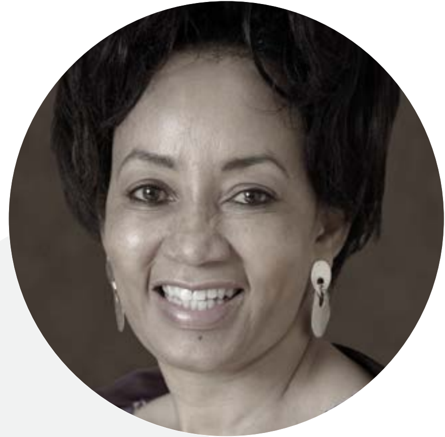
Minister of Human Settlements Lindiwe Sisulu

We want to reconfirm that we remain firmly in her footsteps and those of her late husband Oom Govan Mbeki, both of whom were champions who served the interest of their people until their last day came. Our thanks go to the Mbeki family who allowed us when we started with these Awards process in 2006, to name the event after an outstanding stalwart - wOom Gov. We enjoyed total support from the late MaMbeki and we are grateful for that.