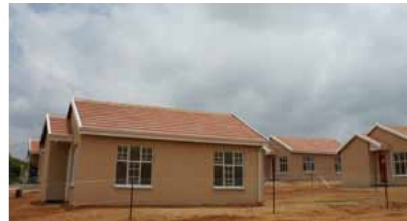
Above: Homes are spaced comfortably apart to allow for gardening activities to raise the aesthetic of the surrounds.