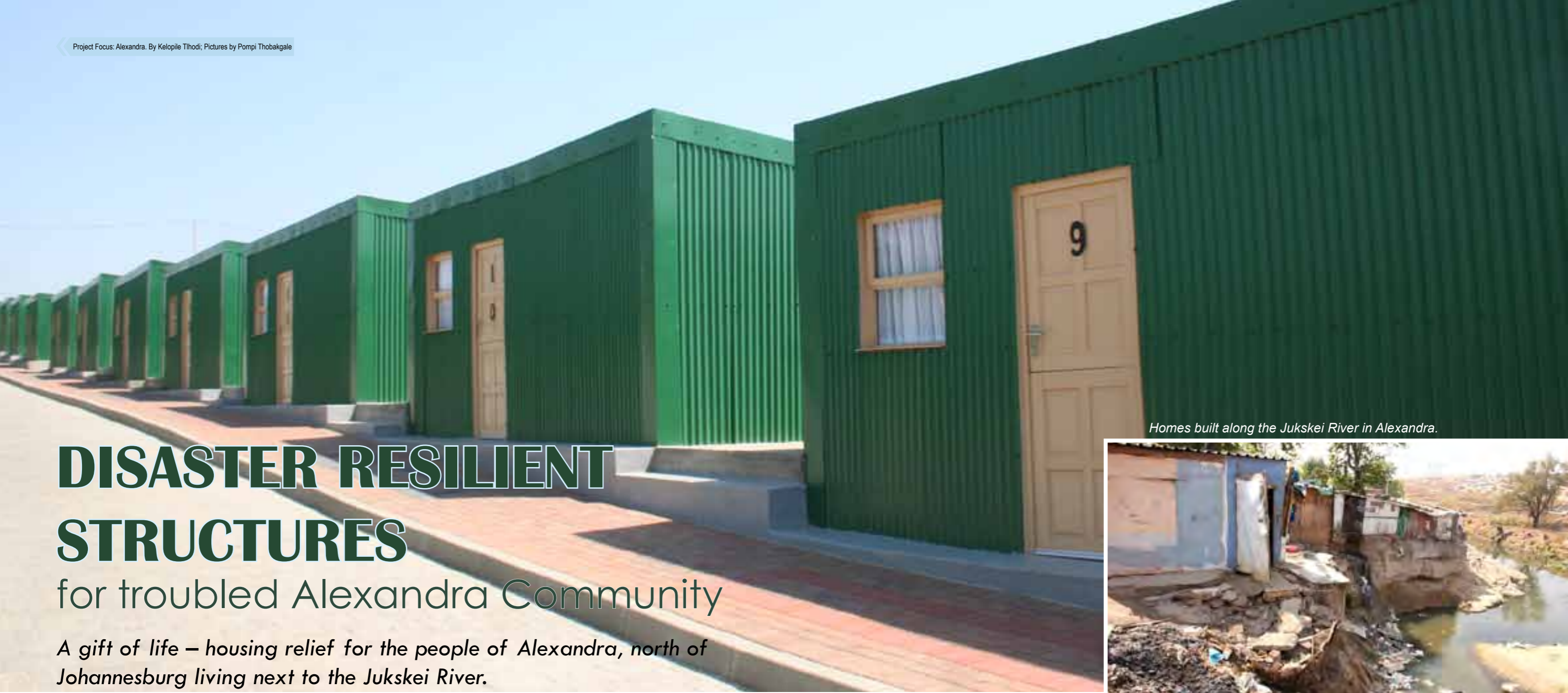
Homes built along the Jukskei River in Alexandra.