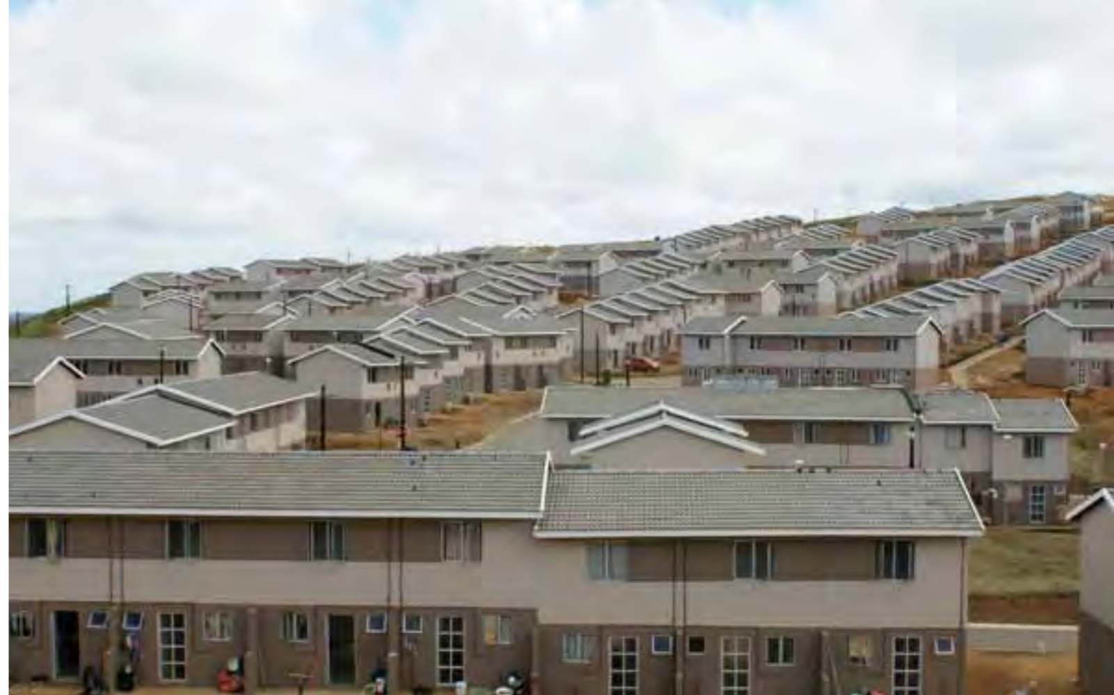
The stunning Cornubia settlement is perched on top of the rolling hills of Mount Edgecombe, approximately 7km from King Shaka International Airport.

Women's Build is a Letsema project coordinated annually during Women's Month. It is a partnership project between the Department of Human Settlements, private sector and the community to raise consciousness about the construction sector and the women's role in it. It also promotes volunteerism and women's access to human settlements economic opportunities.