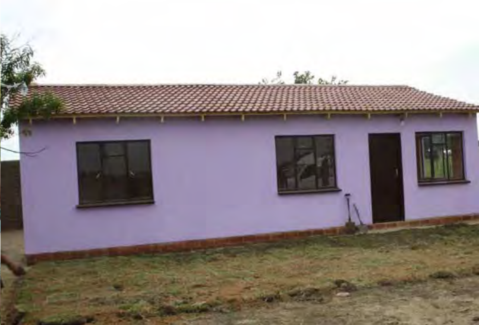
Above: One of the houses handed over during the Media Build 2014. These larger units were built to accommodate the bigger families of the beneficiaries.